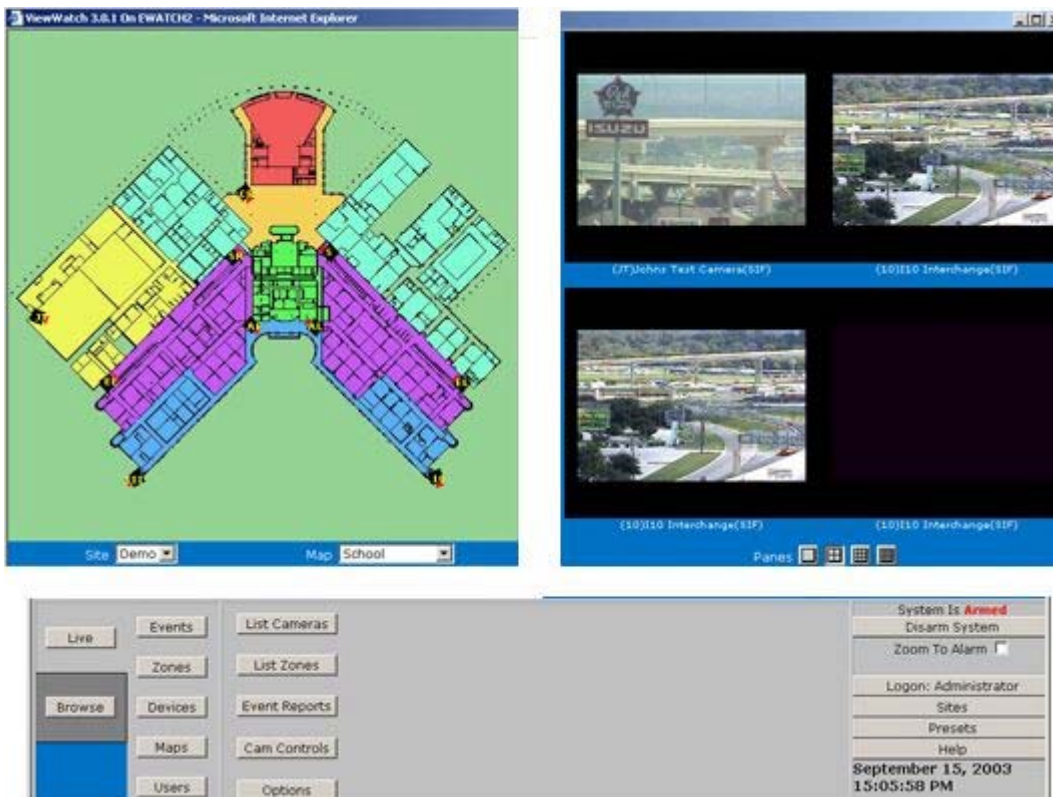
Figure 3-1. Main Screen

ViewWatch is an Internet-enabled application that provides the interface for viewing the MPEG or MJPEG video streams produced by e-Watch cameras and encoders. The interface screen is divided into three main sections. The upper left portion of the window displays a facility map. The upper right portion of the screen is the video window. The lower portion of the screen contains software and camera controls. ViewWatch can be operated in Live Mode to view real time video, or in Browse Mode to view archived video.